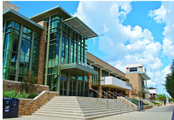
Figure 2 Memorial Student Center (MSC)