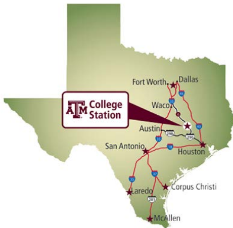
Figure 1. College Station, Texas