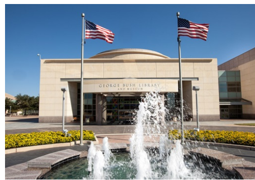
Figure 6 George Bush Presidential Library and Museum