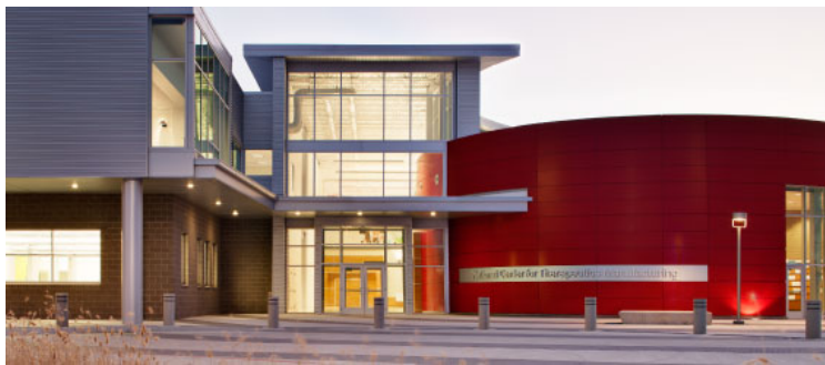
Figure 8 National Center for Therapeutics Manufacturing

Tours of six manufacturing labs at the Conference Site will be arranged. Each lab, for example the Materials Characterization Center and National Center for Therapeutics Manufacturing (Figure 8), has a specific focus related to manufacturing. This will be a walking tour through these laboratories and centers on the TAMU main campus (Table 3). A bus will be arranged to transport participants to the off-campus/west-campus labs. The Organizing Committee will also arrange technical tours to companies such as Halliburton, Schlumberger, and US Steel in Houston area (1.5-hour drive).