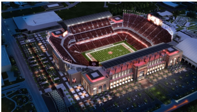
Figure 5 Kyle Field

College Station and the neighboring city of Bryan have a wonderful selection of quality attractions all within a 10 mile radius of Texas A&M University. Texas A & M University has several galleries and museums, horticultural gardens, pavilions and a full tour of the campus, which explains the various traditions. Cultural attractions include: the George Bush Presidential Library and Museum (Figure 6), the Brazos Valley Museum of Natural History, the Brazos Valley African American Museum, and the Brazos Valley Children’s Museum. The Messina Hoff Winery and Resort offers wine tasting and tours. The area has many wonderful parks such as Wolf Pen Creek Park with an amphitheater and Veterans Park & Athletic Complex. Downtown Bryan offers boutiques, shops and restaurants from casual to fine dining along with art galleries and music venues set among the quant historic buildings of a classic American downtown main street.