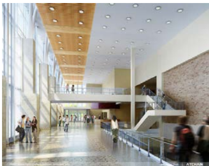
Figure 3. MSC Entrance Hall

The conference program will be held in the Memorial Student Center (MSC) on the Texas A&M campus (Figure 2). The Memorial Student Center promotes leadership development through campus programs and service opportunities. Through its recently renovated facilities (Figure 3), the MSC provides students with academic, cultural awareness, and arts programs. For the conference, the opening ceremony, banquet, and meals will be held in the MSC ballroom (Figure 4), with 15,824 sq. ft. space and 992 maximum banquet sitting capacity. There are at least 12 meeting rooms with lecture capacity of 40 to 160 for parallel sessions. Committee and board meetings can be held in four separate conference rooms each with a capacity of 18. These conference rooms can also be used as staff and author preparation rooms. The Event Services Office at Texas A&M will provide audio/visual equipment. On-site technical support will also be available. Table 1 shows the MSC meeting rooms and their capacities. Inside the MSC, there is ample hall space near the meeting rooms for attendees to interact. There are also stores, courtyards, art galleries, and exhibition rooms in MSC. The Organizing Committee will explore the possibility of hosting a reception at the recently renovated Kyle Field Stadium (Figure 5).