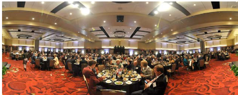
Figure 4 MSC Ballroom